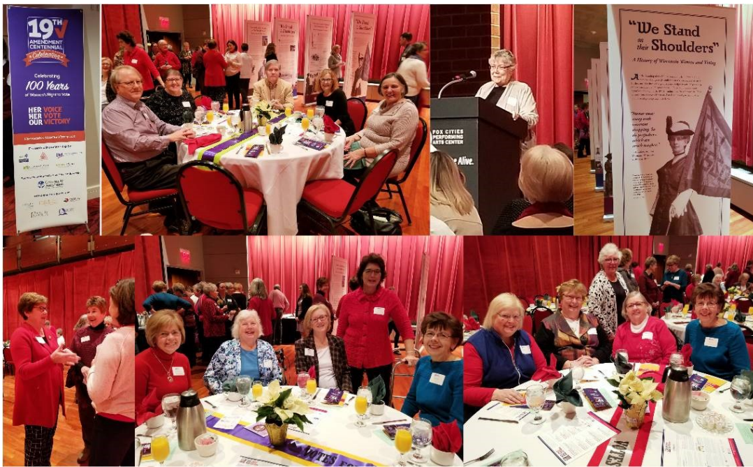
Scenes from the 12/14 Centennial Kickoff Brunch. Excellent turnout of AAUW members!

Our group represents the League of Women Voters of Appleton, Northeast Wisconsin Alumnae Chapter of Delta Sigma Theta Sorority Inc., Women's Fund for the Fox Valley Region, American Association of University Women—Appleton, Mid-Day Women's Alliance and more.